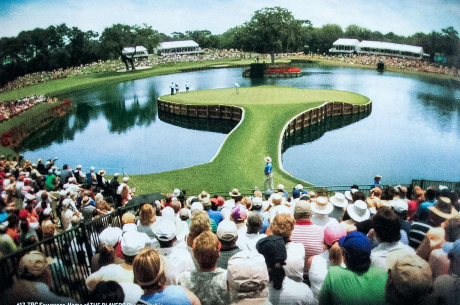
#17, TPC Sawgrass, Home of THE PLAYERS Championship